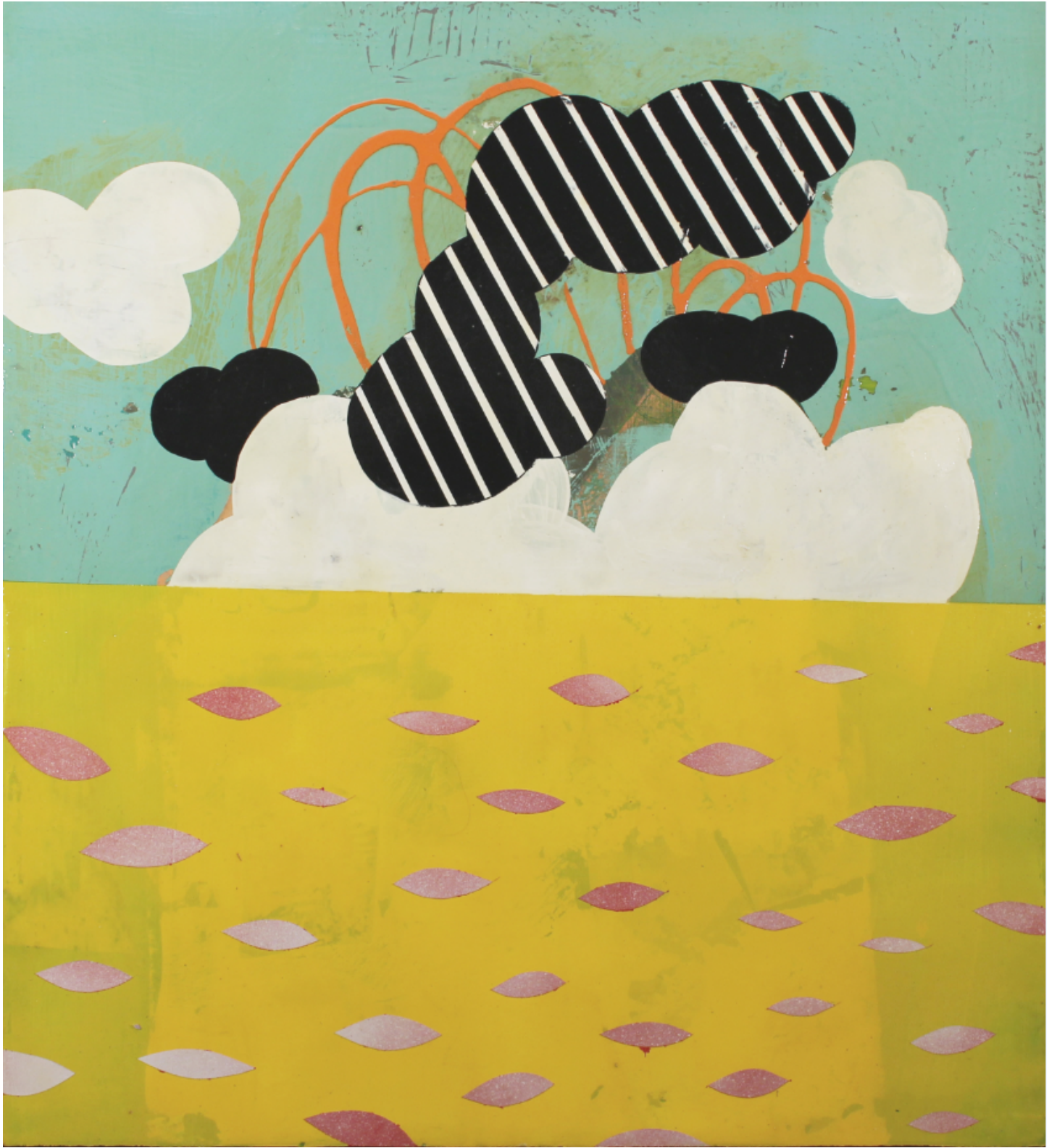
Figure 6. Fidalis Buehler, White Cloud Caution Flasher , oil painting on panel, 18 × 20 in.