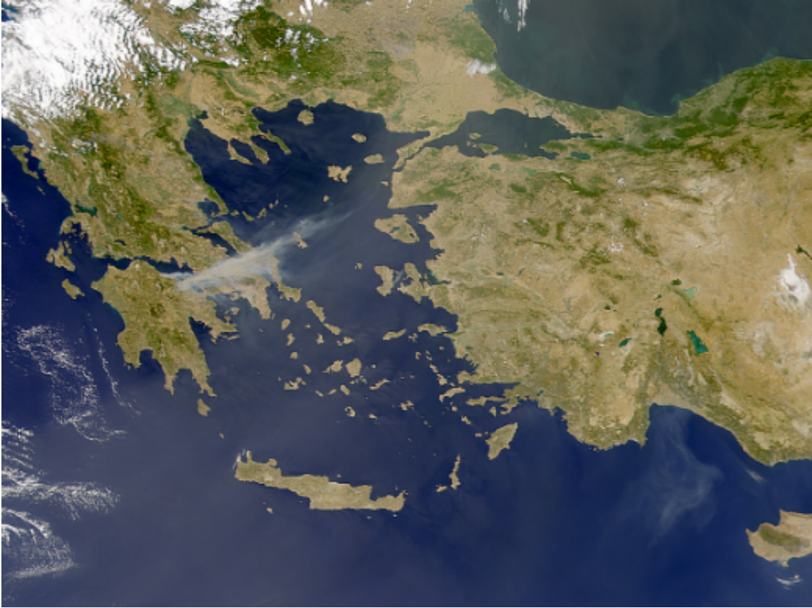
Figure 1. Satellite Image of the Aegean Sea, from NASA via Wikimedia Commons.

Contradictory Omens spoke of the Caribbean as a place of “interlapping,” or mutual palimpsest, where various items reciprocally inscribe themselves on each other. At the site of this interlapping, he said, “[t]he idea is to try to see the fragments/whole,” using a slash. 1 We wish to frame the slashes in this forum’s title as signifying an interlapping relationality among the three components and a charge to see—both conceptually and visually—the interlapping fragments-slash-whole among archipelagoes/oceans/Americas.